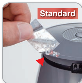
Tamper-evident on Turntable