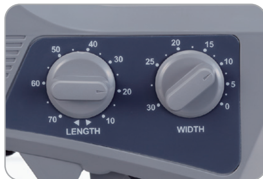
Scale is on the knob as a guide.